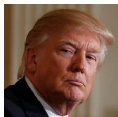
President Donald Trump