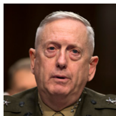
Secretary of Defense James Mattis