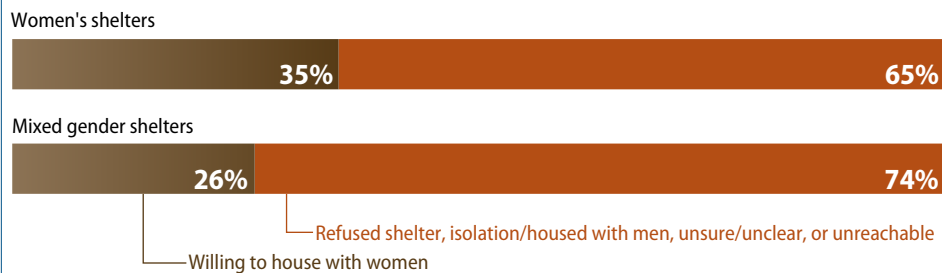
FIGURE 3 Women's shelters were more likely to be willing to provide a test caller with appropriate shelter