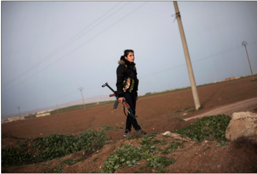
A Kurdish female member of the Popular Protection Units stands guard at a checkpoint near the northeastern city of Qamishli, Syria. Syria's Kurds have dramatically strengthened their hold on the far northeast reaches of the country, carving out territory as they drive out Islamic militant fighters allied with the rebellion and declaring their own civil administration in areas under their control amid the chaos of the civil war.