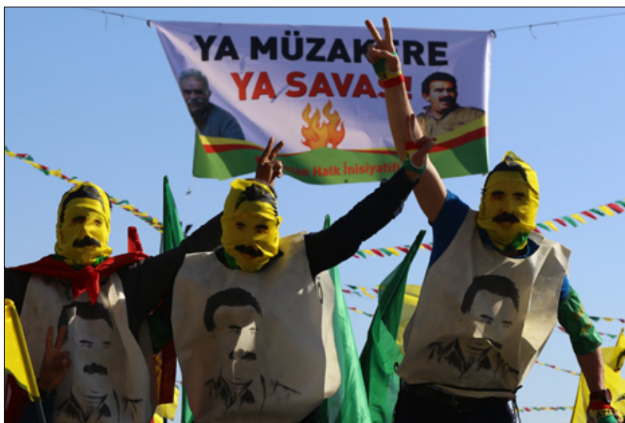
Men with their faces covered by images of jailed Kurdish rebel leader Abdullah Öcalan demonstrate during the Nowruz celebrations in the southeastern Turkish city of Diyarbakır, Turkey. The banner reads, “Negotiation or the war!”

There were political considerations driving the process as well: An estimated 2 million to 4 million Kurds lived in Istanbul alone, and the group had become an important reservoir of voters. 24 The leaders of the AKP tried to emphasize “brotherly unity” between Turks and Kurds, invoking Islamic tradition to avoid confronting the legacy of state violence and forced assimilation head on, a confrontation that would undoubtedly trigger a nationalist backlash. 25 It became clear that a permanent solution would only be found if common political ground were established that acknowledged past crimes and reversed the nationalist Turkish heritage codified in the constitution and reinforced by the state-dominated education system.