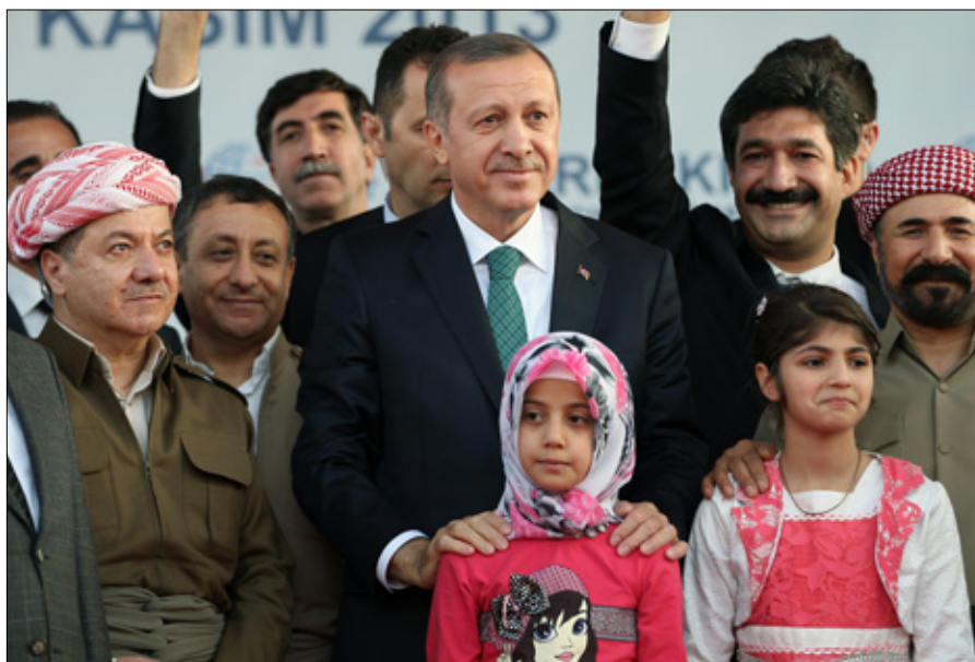
Turkey's Prime Minister Recep Tayyip Erdoğan, center, Iraqi Kurdish leader Massoud Barzani, left, and Kurdish singer Sivan Perwer, right, attend a mass marriage ceremony for 400 couples in the southeastern Turkish city of Diyarbakır, Turkey. Barzani was in Turkey to support the Turkish government's Kurdish peace process.