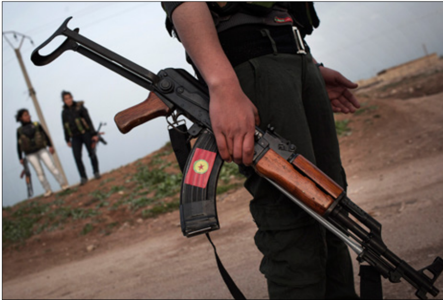
Kurdish female members of the Popular Protection Units stand guard at a checkpoint near the northeastern city of Qamishli, Syria. Syria's Kurds have taken first steps toward creating an autonomous region similar to the one across the border in Iraq, which is run as virtually a separate country. But the Kurds' drive has angered rebels who are fighting to topple Syrian President Bashar al-Assad.

The Kurdish forces' battlefield successes have been impressive since the Assad regime's withdrawal. The YPG captured the town of Manajeer, near the Turkish border, and expelled all Al Qaeda-linked forces from the border province of Ras al-Ain in late 2013. Over the first few months of this year, the YPG captured 19 towns and villages spanning Syria's northeastern border. Just one week before capturing Manajeer, the YPG overtook the Iraqi border-crossing point in the town of Yarubiya. 78 Despite the uneasy and sometimes violent relationship between the PYD and the patchwork of Sunni rebel groups in Syria, Kurdish forces have managed to preserve a modicum of stability in areas under their control. Fighting continues for control of key towns and border crossings, such as Ceylanpinar-Serekaniye, and the access to outside supplies that the crossings bring. 79