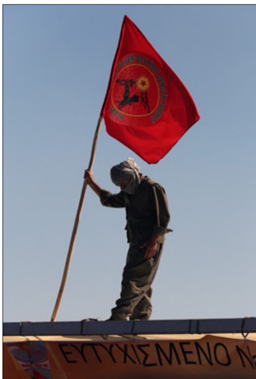
A masked man in a guerrilla outfit holds a flag of the PKK during the Nowruz celebrations in the southeastern Turkish city of Diyarbakır, Turkey. Nowruz, the Farsi-language word for “new year,” is an ancient Persian festival celebrated on the first day of spring, March 21, in the Central Asian countries of Iraq, Turkey, Afghanistan, and Iran.

The incentives for the Turkish government to get past these stumbling blocks and conclude a permanent peace are strong, with regional and international governmental stakeholders also poised to benefit. For the AKP, a successful resolution of the Kurdish issue could help neutralize one of the major obstacles to meaningful democratic reform in Turkey—if, indeed, that remains a goal of the party. 56 In addition, a successful completion of the peace talks with the PKK and a political solution to the multidecade conflict with the PKK would be a major boon to Prime Minister Erdoğan in the months leading up to the presidential election in August. 57