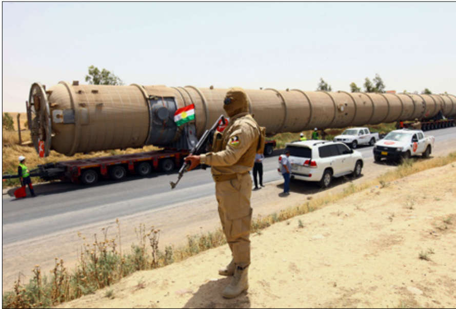
A Kurdish Peshmerga fighter stands guard as new equipment arrives at Kalak refinery on the outskirts of Erbil, Iraq, as Kurdish authorities are trying to help ease the fuel shortage. Islamic militants have laid siege to Iraq's largest oil refinery in the city of Baiji.