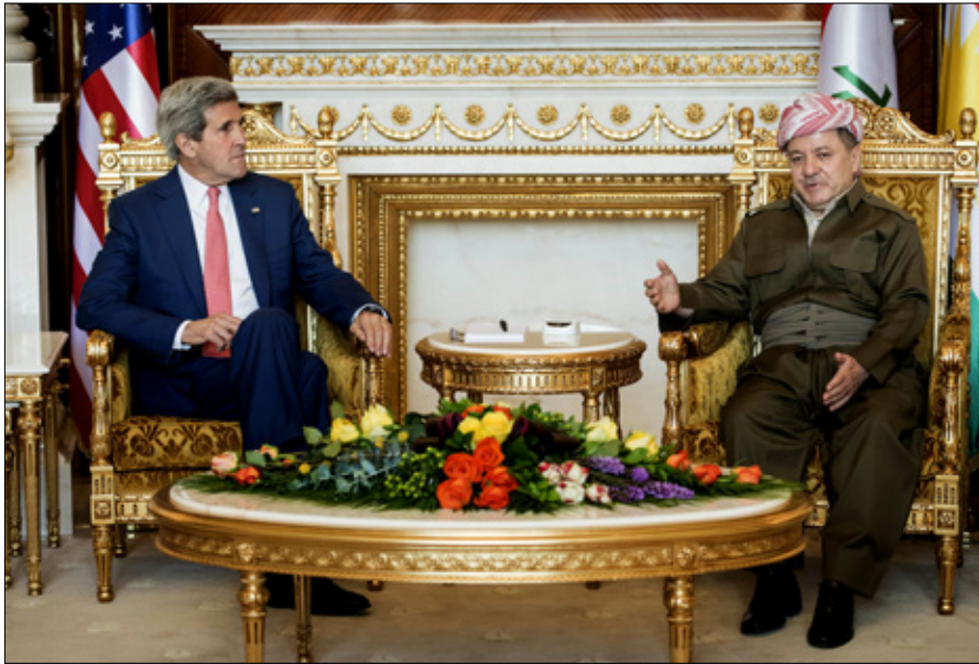
Kurdish regional President Massoud Barzani, right, speaks during a meeting with U.S. Secretary of State John Kerry at the presidential palace in Erbil, Iraq. Kerry arrived in Iraq's Kurdish region in a U.S. diplomatic drive aimed at preventing the country from splitting apart in the face of militants pushing towards Baghdad.