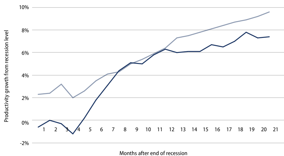
FIGURE 2 Postrecession productivity growth