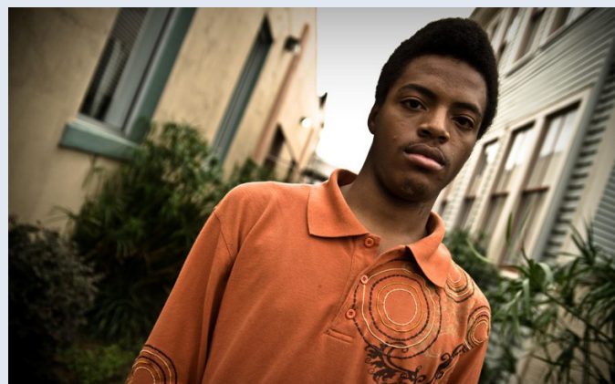
JUVENILE JUSTICE PROJECT OF LOUISIANA, 2010

His story is all too familiar for gay and transgender youth in this country. Unsafe schools and unfair criminalization of gay and transgender students can perpetuate a vicious cycle where gay and transgender youth, especially those of color, are pushed through the juvenile justice