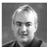
Walid Shoebat Former purported Islamic terrorist turned apocalyptic Christian