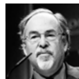
David Horowitz David Horowitz Freedom Center