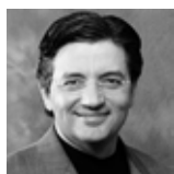
Zuhr Jasser American Islamic Forum for Democracy