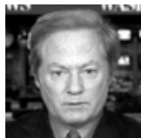
Steven Emerson The Investigative Project on Terrorism