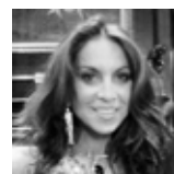
Pamela Geller Stop Islamization of America