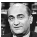
Walid Phares Future Terrorism Project