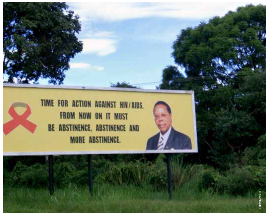
A billboard in Malawi reflects a new and riskier approach to HIV prevention.

PEPFAR defined “those who practice high-risk behaviors” as “prostitutes, sexually active discordant couples [that is, couples in which only one partner is known to have HIV], substance abusers, and others.” 30 The definition did not mention the promotion of condoms to youth generally, but said that funds may be used for programs that provide age-appropriate “ABC information” for young people—with different standards for in-school and out-of-school youth—provided they were informed about failure rates of condoms and that the programs did not appear to represent abstinence and condom use as equally viable alternatives. 31