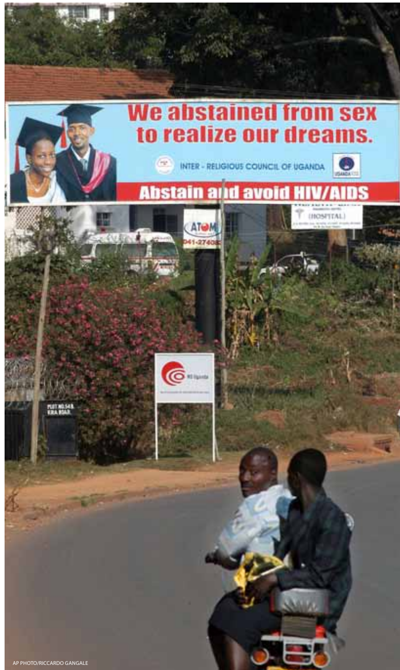
A billboard in Kampala, Uganda advises people to abstain from sex. Billboards urging condom use have disappeared from the capital. In their place are posters, some funded by the United States, encouraging youth to delay their sexual debut until they marry.

Another factor that probably contributed to the decline in HIV/AIDS prevalence is the rise in the number of AIDS-related deaths, since antiretroviral treatment was not widely available in Uganda at the