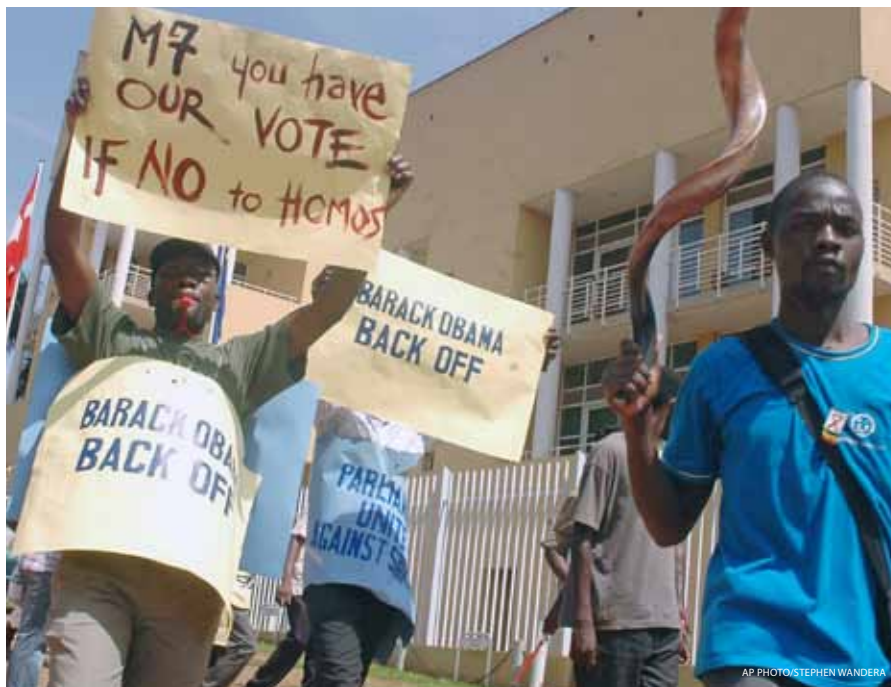
Members of the Uganda National Pastors Task Force Against Homosexuality demonstrate in Kampala in December 2009. The group marched near embassies, telling the international community to back off from their criticism of the anti homosexual bill that is in the making in Parliament. The law that threatens a death sentence to homosexuals has attracted critics including President Obama.