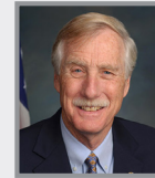
Angus King (I) ELECTED AFTER VOTE