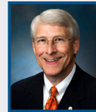
Roger Wicker (R) YES