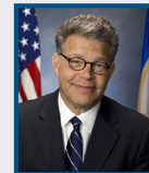
Al Franken (D) YES