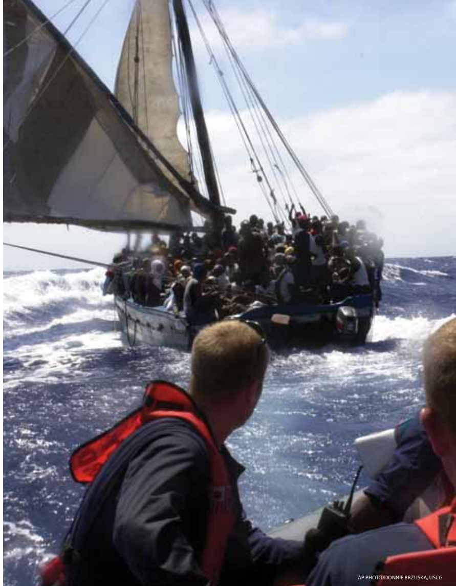
A boarding team from the Coast Guard Cutter Forward approaches a heavily laden migrant vessel from Haiti. Many young Haitians aspire to leave the country as soon as they are able to secure a better life abroad.

spectrum of talent, from hard-working laborers to skilled professionals. At the same time, Haiti has a desperate need for intellectual capital. Only 15 percent of Haitians in Haiti have a high school education, 52 and less than 1 percent is college-educated. 53 A study by the Organization for Economic Cooperation and Development found that 80 percent of Haiti's college-educated citizens live outside of Haiti. 54 The Haitian government has a direct interest in having educated members of the diaspora return to contribute their talents directly to the country's development.