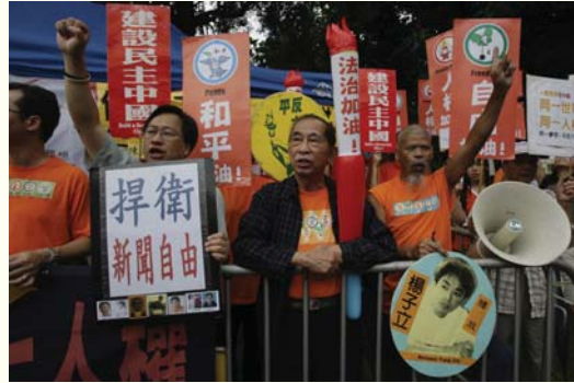
Human rights and pro-democracy activists demonstrate outside the venues for the Olympic equestrian competition in suburban Sha Tin district, Hong Kong Friday, Aug. 8, 2008.

strengths and weaknesses. The uncertainties regarding China's possible future pathways cut across a broad range of issues, from internal governance, to military