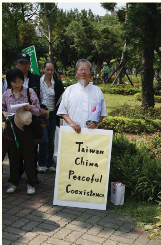
Taiwan is the most sensitive issue in the U.S.-China relationship.

Maintaining the now standard set of diplomatic assurances that offer a common language for Beijing and Washington and Taipei is an important starting point for any efforts to address cross-Strait issues. The