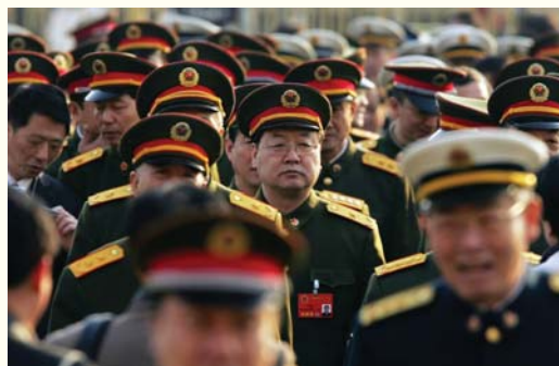
Military delegates arrive for the opening ceremony of the National People's Congress at Beijing's Great Hall of the People Wednesday March 5, 2008.

The new president should task the Department of Defense with conducting an in-depth assessment of the ability of U.S. forces to fulfill our security commitments in the Western Pacific in the face of