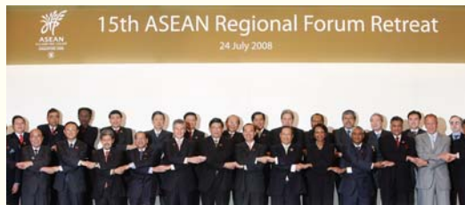
Delegates meet in Singapore at the 15th ASEAN Regional Forum Retreat on July 24, 2008.

To get national security policy toward China right, the United States needs to get its Asia-Pacific regional strategy right. Stability and security in East Asia is increasingly tied to overall U.S. national security goals; conflict and instability in East Asia