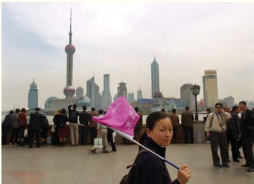
A local tour guide walks along the Bund, one of the most visited tourist destinations in Shanghai. In the background is Pudong, the city's new business and finance landmark.

The United States should move beyond the engagement strategy we've pursued for 30 years and seek China's integration into the international system as a responsible, engaged, and respected stakeholder so it can address urgent global problems such as climate change. In the long run, this will strengthen the international system and will also help mold China's behavior. The United States should signal to China that it understands China occupies an important place in the existing international order, that its development depends on the preservation of that order, and that the United