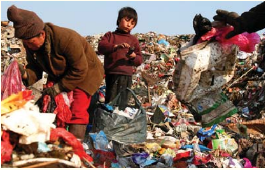
Poverty remains prevalent despite economic growth in China.

more societal input into policy decisions.