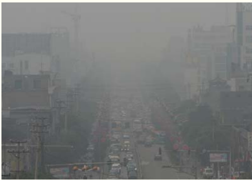
China's emissions accounted for two-thirds of the growth in global greenhouse gas emissions in 2007.

China's environmental problems are enormous and growing worse by the day. China's leadership has an enormous stake in finding sustainable solutions to its environmental and energy challenges for its own well-being. Unchecked global warming could have devastating consequences for China, and the country is already feeling the impact of horrific pollution problems on its people, government, and economy.