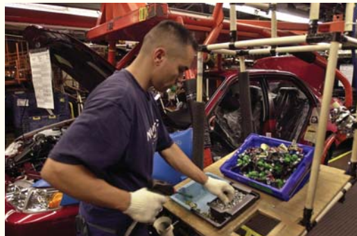
The next administration must work to promote U.S. businesses.

At home, the next administration must renew our domestic competitiveness. America must invest in human capital and create a nimble,