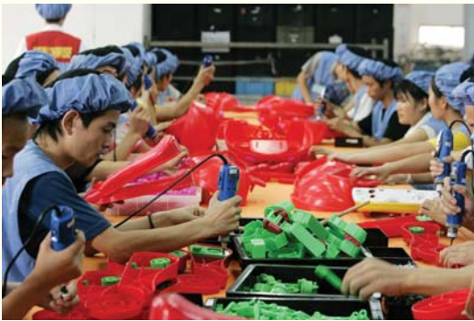
Workers assemble toys at the production line in Dongguan, China.

The next administration will need to build a more equitable and mutually advantageous economic relationship with China. It must encourage China to be a more responsible steward of the international economic system, and to accelerate market-based economic and labor market reforms. But the next administration must also improve America's own economic and technological competitiveness so that our country competes in the global economy from a more secure position of strength. An important measure of whether the next administration manages a successful economic relationship with China will be rising standards of living for a greater number of Americans, as well as a greater number of Chinese.