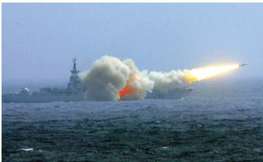
Dozen of warships of the South China Sea Fleet were deployed in the competitive training to improve combat capability of the fleet, Xinhua said.

Persuading China to consider its global responsibilities has not been easy, but working through multilateral channels and building international pressure has effectively induced China to modify its stance, at times, on certain controversial issues, among them nonproliferation and dealing with North Korea. The United States must strengthen