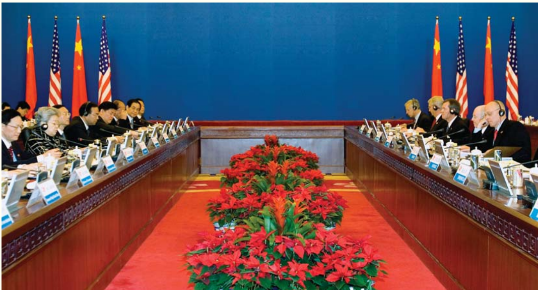
Chinese Vice Premier Wu Yi, 2nd left, and U.S. Treasury Secretary Henry Paulson, right, with both countries delegates sit during the Third China-U.S. Strategic Economic Dialogue at Grand Epoch City in Xianghe, central China's Hubei province, southeast of Beijing.

and responsible global partner, give China a greater stake in the current system, and further bind China to the global success of these efforts. Working toward this goal is imperative because effective solutions to the most pressing problems of our time—global warming, terrorism, pandemic disease, expanding the global middle class, and nuclear nonproliferation—cannot happen without the full participation of the United States and China.