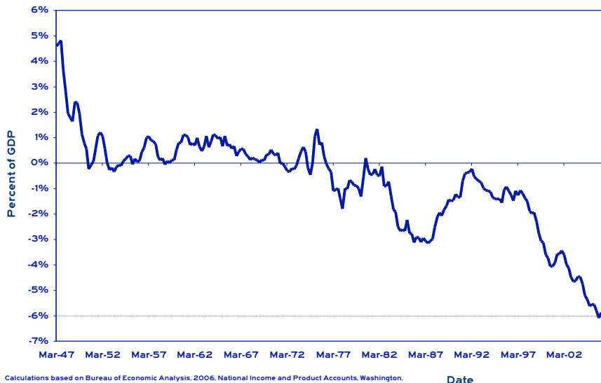
Trade Balance Relative to Gross Domestic Product (GDP), 1947 to 2006

Calculations based on Bureau of Economic Analysis, 2006, National Income and Product Accounts, Washington, D.C.; BEA; U.S. Census Bureau, FT900 U.S. International Trade in Goods and Services, Washington, D.C.; Census