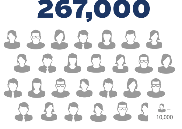
For them, a path to citizenship would mean:

The Senate's immigration bill creates a path to citizenship for the more than 267,000 LGBT undocumented adults living in the United States.